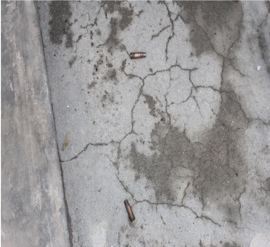
Signs bullets were shot