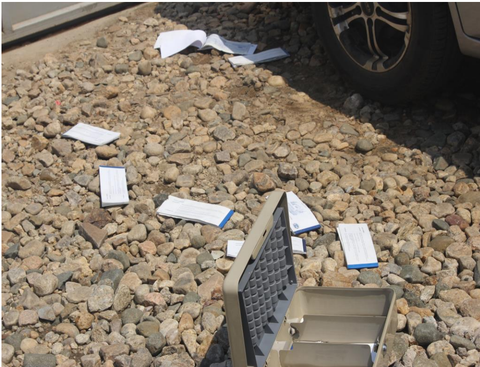
The checkbooks scattered and the box shot at and destroyed.

It looks like, according to the first elements we are gathering, it is mostly a robbery, and the office that was broken into was the accountant's office. Other doors were shot at but not as bad.