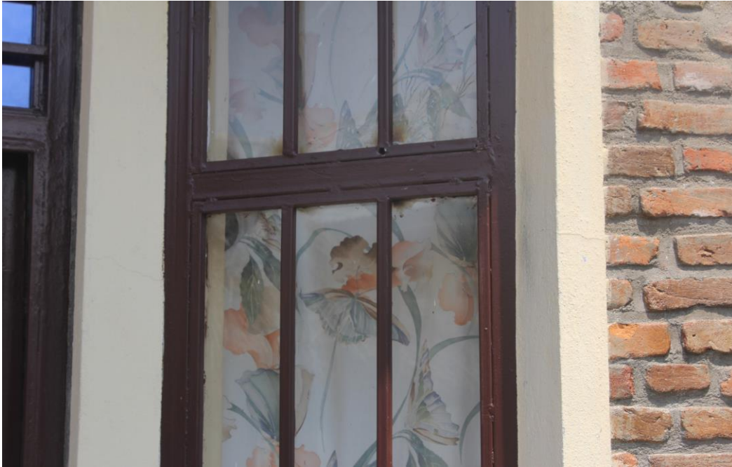
One bullet went into this room. And a young man was sleeping there