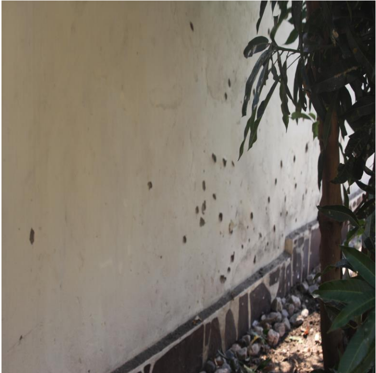
Impact of the grenades on the wall