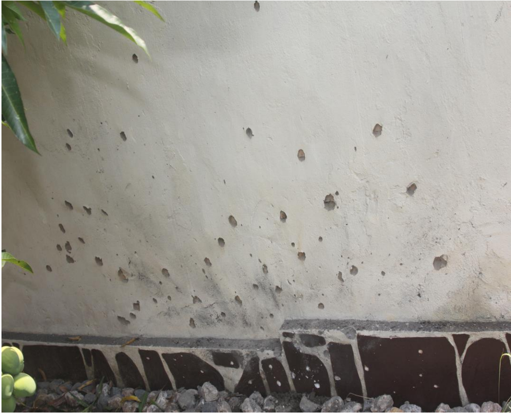
Impact on the wall from a different side