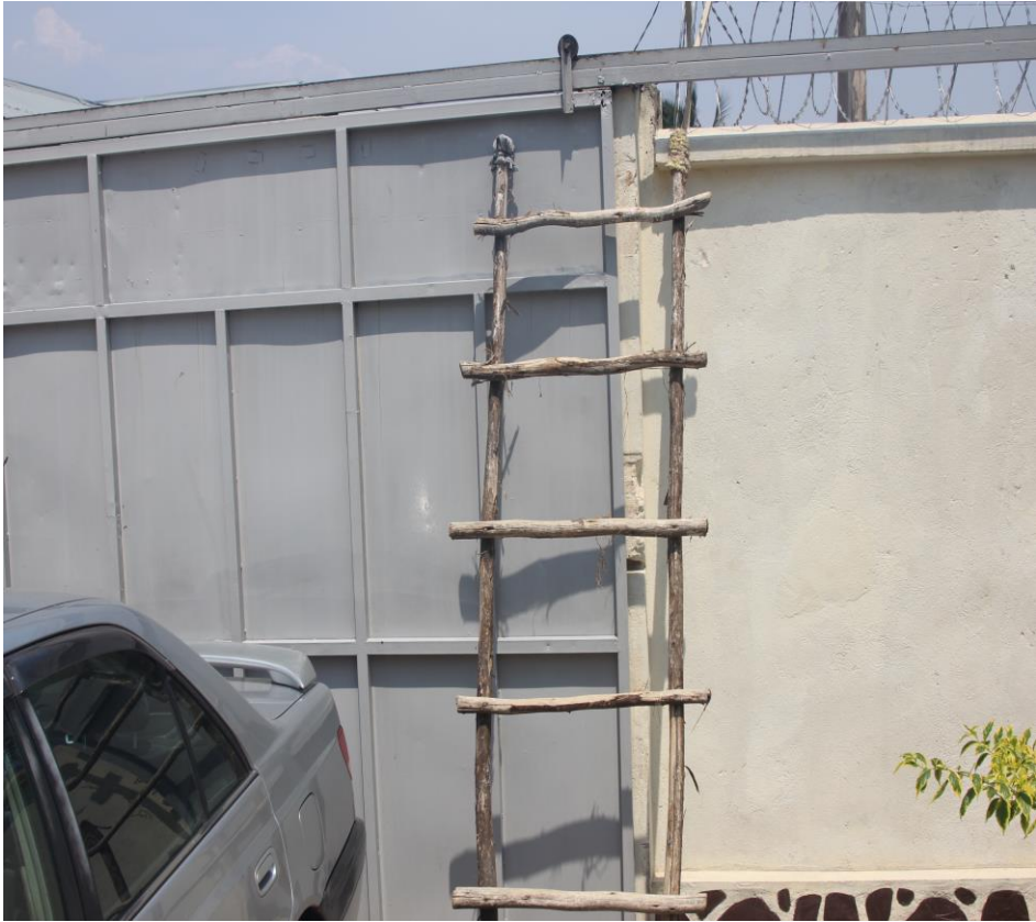
Ladder used to climb back the wall